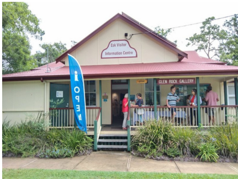
Friends celebrating 'A Wild Embrace' at Glen Rock Gallery

Members and partners had an enjoyable New Year's lunch in January at the Esk Grand Hotel. Was lovely to catch up. Don't forget to come along to the opening of 'Volatile Terrains'. This exhibition including five local artists opens from 4pm to 6pm on the 15th February 2025. Bookings are essential for catering. See you there. Read on for more fabulous news and opportunities!!