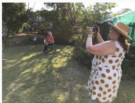
Relaxing garden photography

For afternoon tea, and in addition to the wonderful array of food brought by participants, Phil's wife Peta spoilt us with hot scones straight from the oven. While we were enjoying the discussions, Phil downloaded all the photos everyone took during the afternoon onto his iPad for simulcasting on their TV. This provided a unique opportunity to review and discuss everyone's photos on a large screen and provide valuable feedback – what was good, what wasn't and where to improve were all covered in an enjoyable setting.