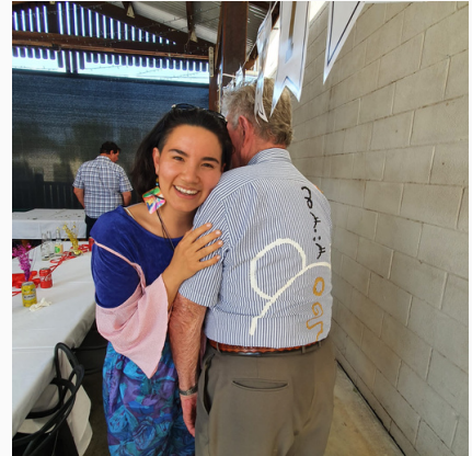
Ze and her grandad wearing a painted shirt