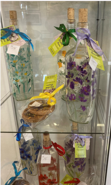
BOTTLE BOUQUETS BY ELIZABETH BROWN